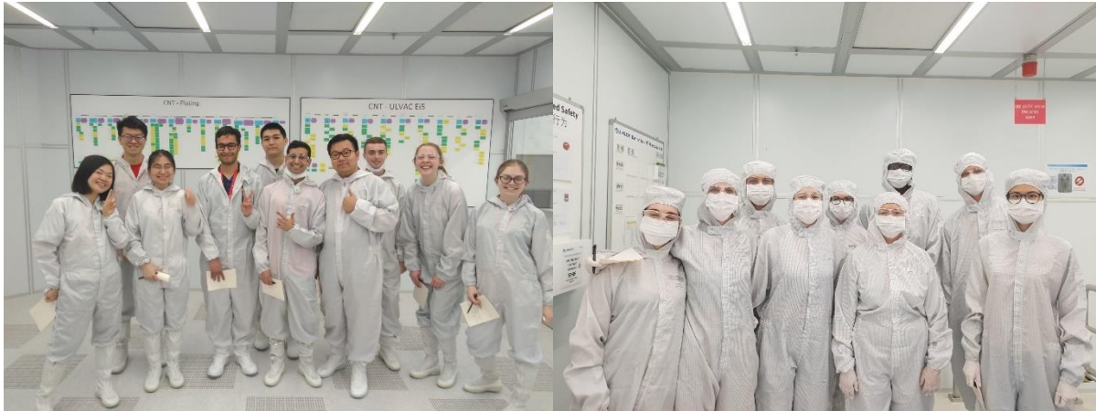
The Oxford party in our protective clothing while at the clean room at LUMILEDS

After Lumileds our coach driver kindly dropped us off in the Marina Bay area, by far the most luxurious area of Singapore. We had the entire afternoon and evening to explore everything from the Singapore Mall, the Gardens by the bay, the Singapore Skywalk as well as the Marina Bay Sands Hotel. In amongst the many highlights of the day was the 15 minute light and water show extravaganza displayed over the water by the Marina Bay. It was such a lovely moment to enjoy the show with the whole group!