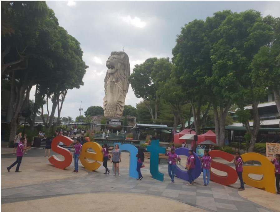
Sentosa Island with the iconic Merlion statue in the background

The weekend provided free time for everyone to pursue their own activities and exploration. A large group of us decided to head to Sentosa Island upon the recommendation of the students from NUS. The island included many tourist attractions such as Universal Studios, a Sea World Aquarium, a butterfly park as well as a beach all of which our group had a chance to explore. On the other hand, a smaller more adventure-driven group of us, took a short cruise to Pulau Ubin island where they went on bike rides to tour the scenery of the island. They reported back to the group that their step away from the more tourist style activities really enabled them to gauge a better sense of the beauty of the country.