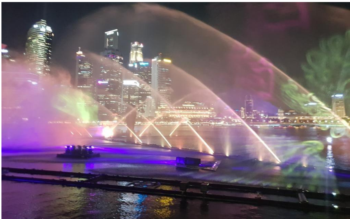
Laser Light Show by the Marina Bay

After Lumileds our coach driver kindly dropped us off in the Marina Bay area, by far the most luxurious area of Singapore. We had the entire afternoon and evening to explore everything from the Singapore Mall, the Gardens by the bay, the Singapore Skywalk as well as the Marina Bay Sands Hotel. In amongst the many highlights of the day was the 15 minute light and water show extravaganza displayed over the water by the Marina Bay. It was such a lovely moment to enjoy the show with the whole group!