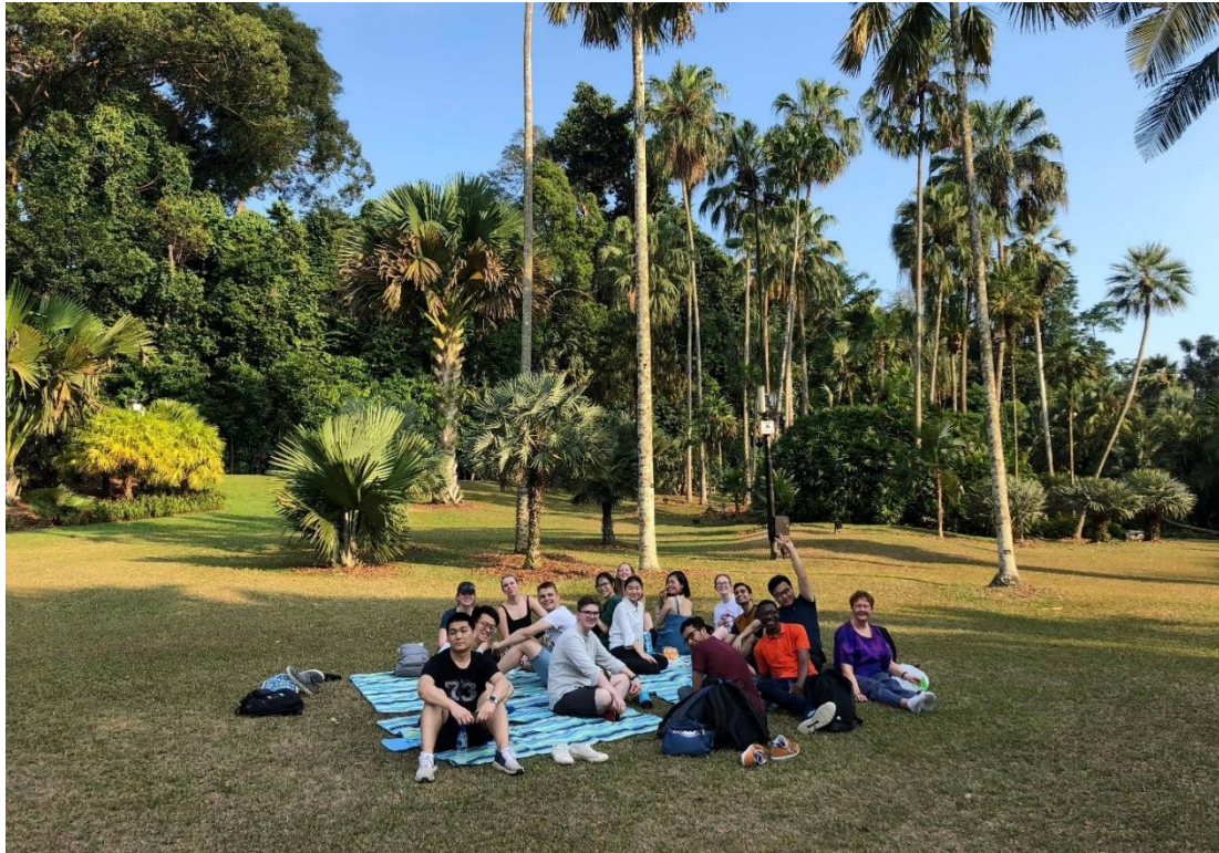
Tour students enjoying a picnic at the Singapore Botanic Gardens