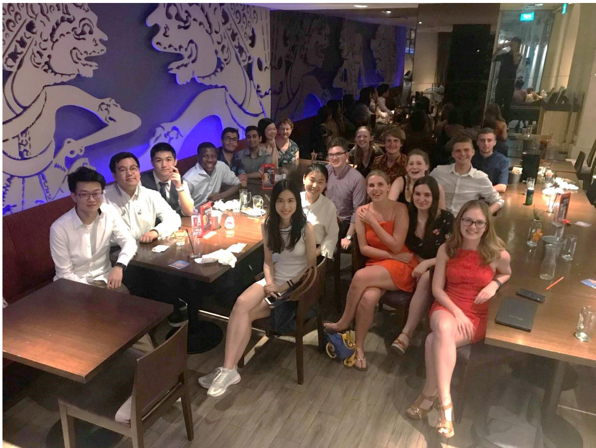
The final tour dinner at Bayang

To end the trip, we had our tour dinner at upon the recommendation of the friends we had made at NUS at Bayang, a restaurant located in the high-end area of Clarke Quay. Unfortunately, they could not join us since they had a polymers exam the following day. It proved to be a fitting end to a thoroughly enjoyable end tour.